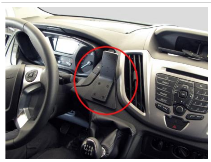
213509 Mounting bracket

Center mount, Extra strength mounting platform.