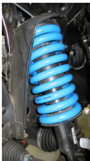
Front Lift spring