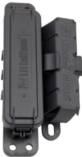
HWA20 interlocked with MEGA-Flex fuseholder (02981028HXFC)

HWA20 interlocks with HWB units, with FLC Power Distribution Modules or bolt-down fuseholders