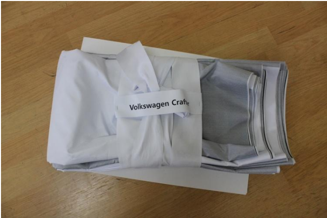
Calibration patterns for VW