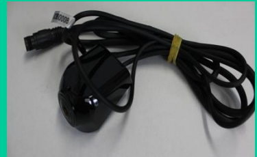
Rear CAM including bracket