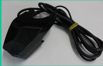
Front CAM including bracket