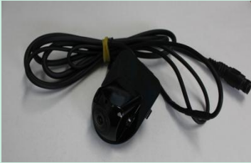
Left CAM including bracket