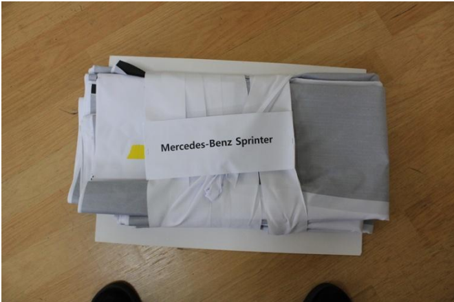
Calibration patterns for MB

Each calibration pattern's materials are included for MB and VW. These are necessary for the calibration works during the actual installation of AVM system at each VAN vehicle.