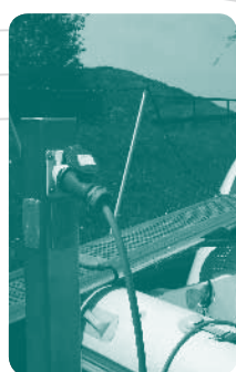
Shore 250V / 50 Hz 1-phase, 2-pole, 3-wire