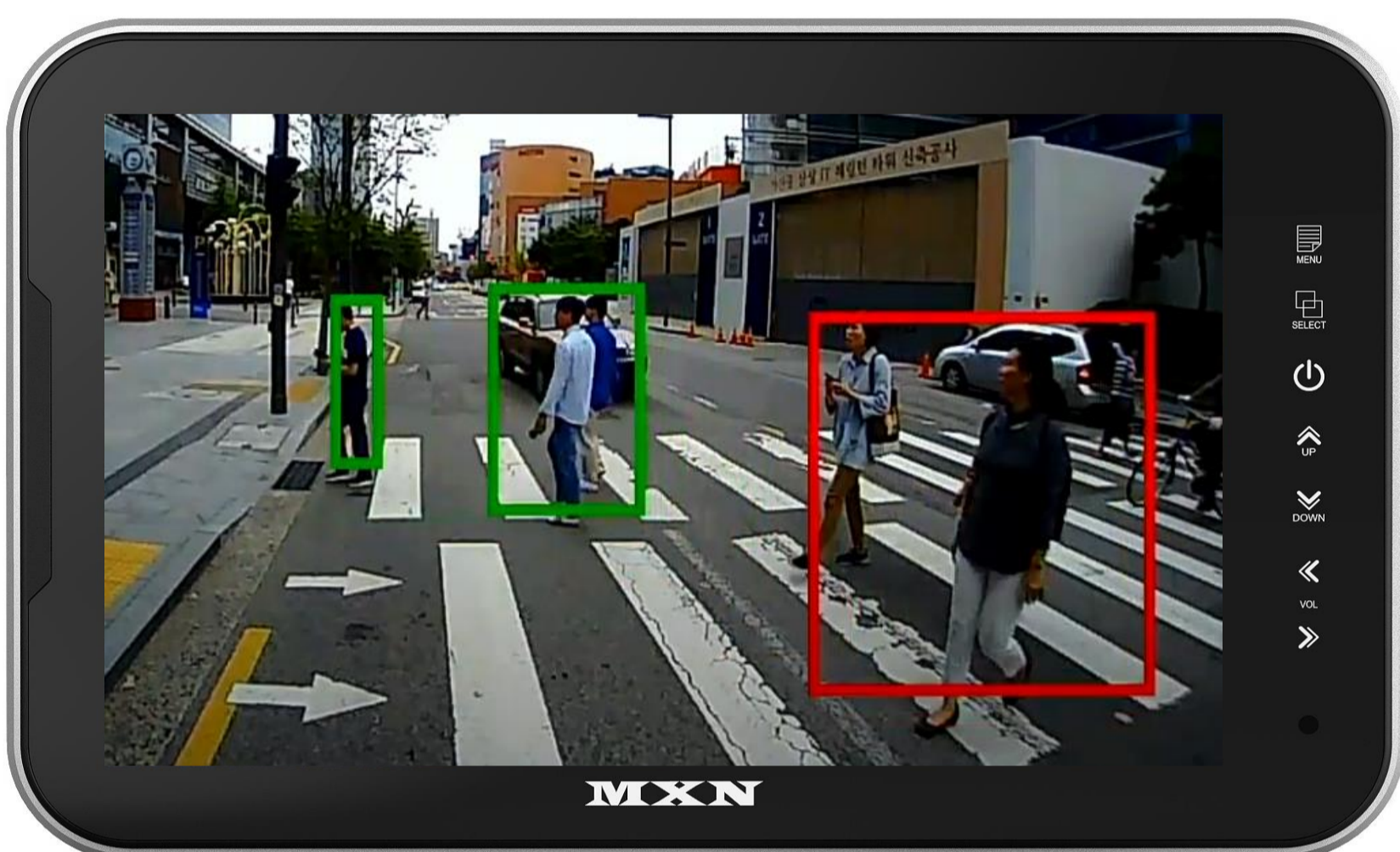
3 Different Color Display