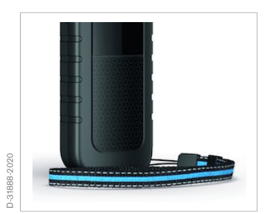
Grips and wrist-straps for secure holding