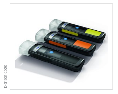
Optional reflector film set (yellow or orange)