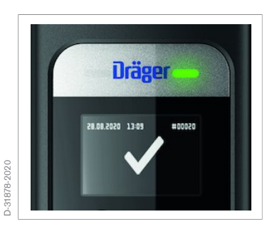
"No Alcohol Detected" symbol