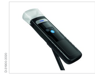
1/4" thread for mounting a selfie stick