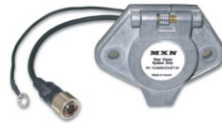
RV 1CAM SOCKET-M