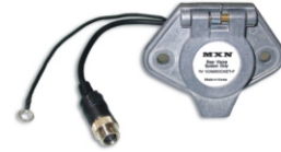
RV 1CAM SOCKET-F