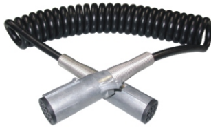
RV CURL CABLE-E