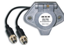
RV 2CAM SOCKET-F