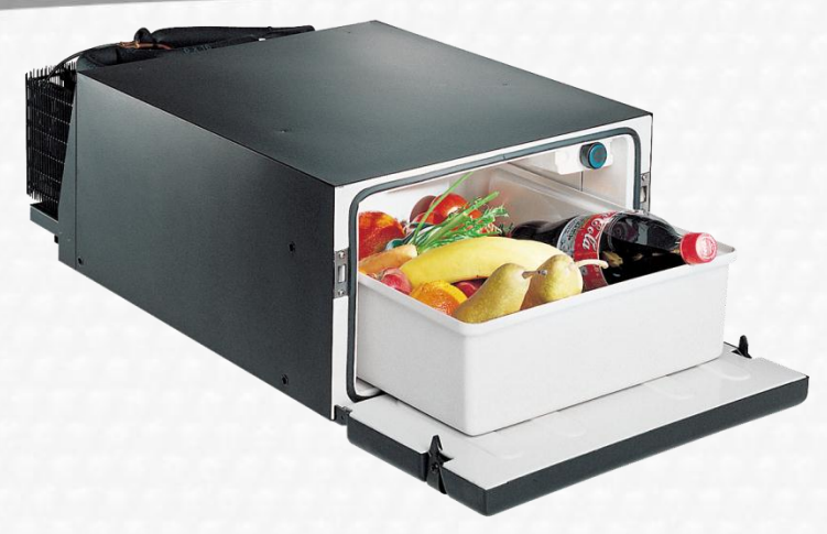
COMPLETE BUILT IN FRIDGES