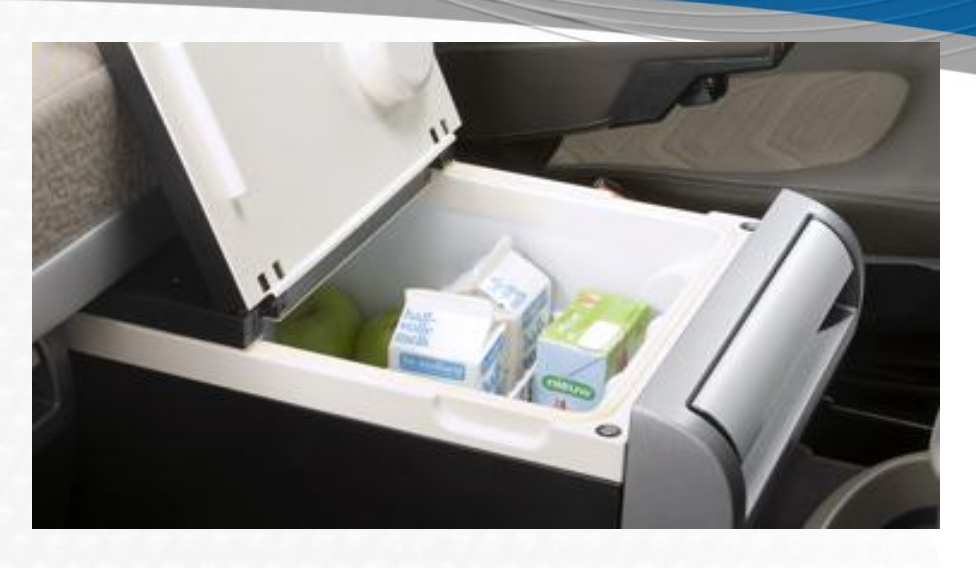
DAF XF105 FRIDGE