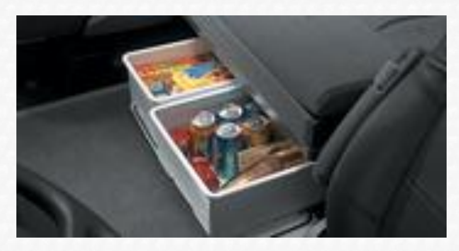
SCANIA R P G FRIDGE