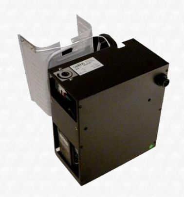
BUILT IN COOLING UNITS