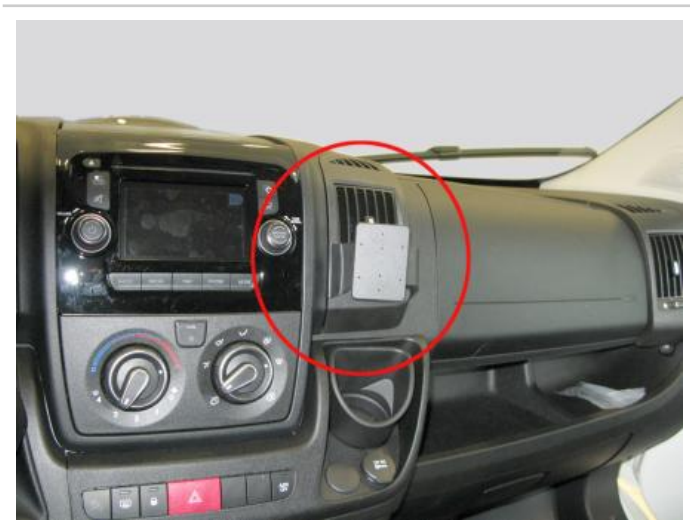
855086 ProClip NOT for Techno models.