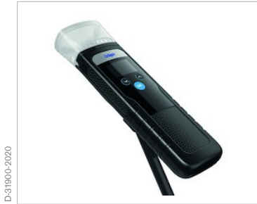
1/4" thread for mounting a selfie stick