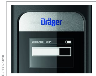
"Test Progress Display" symbol