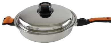
11.5 INCH SKILLET