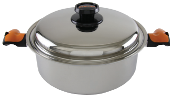
6 QUART STOCKPOT