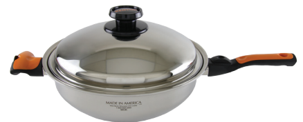
5 QUART WOK