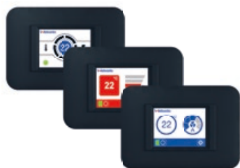
BlueCool MyTouch Display

The BlueCool MyTouch display is the new standard display for all BlueCool A/C Series: