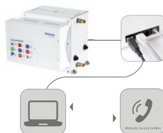
BlueCool Export Tool

BlueCool Export Tool suitable for all BlueCool AC units: