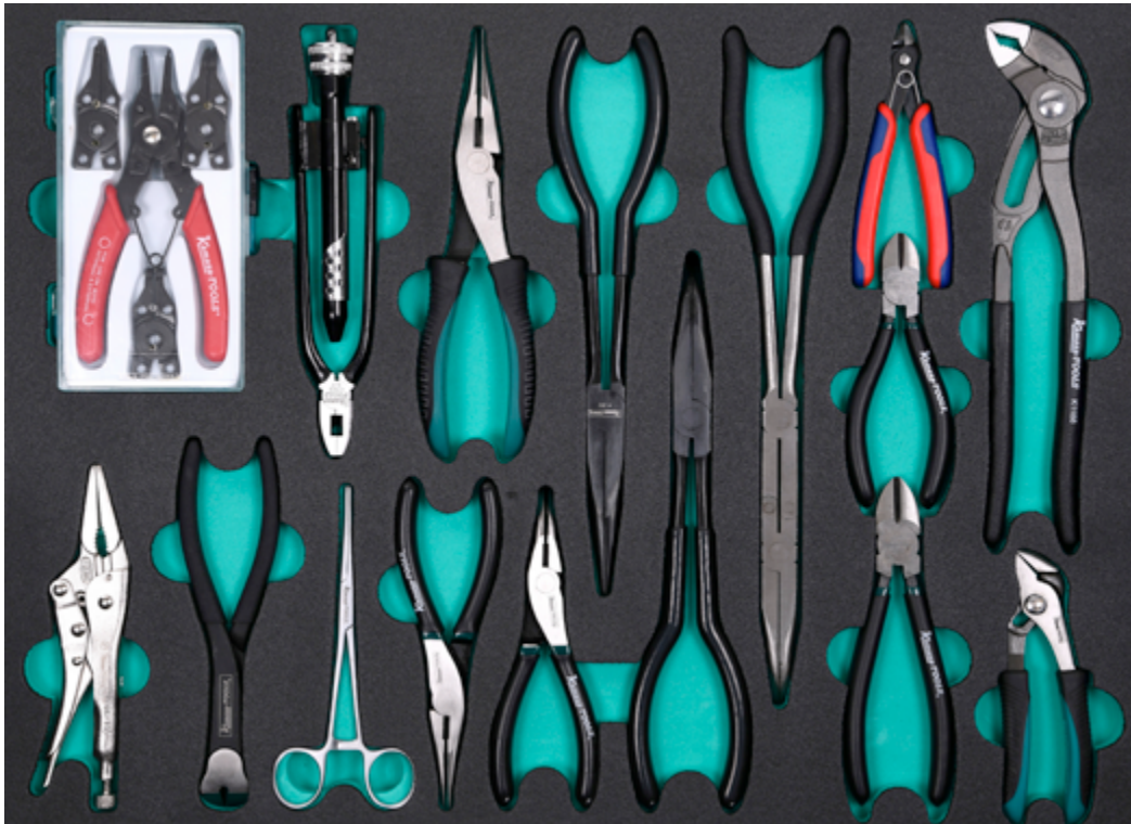
Contents of aviation tool set K 26187