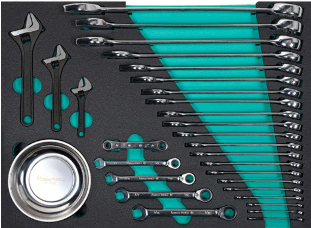
Contents of aviation tool set K 26186