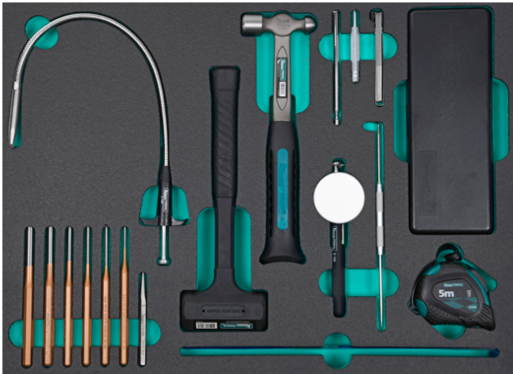
Contents of aviation tool set K26185