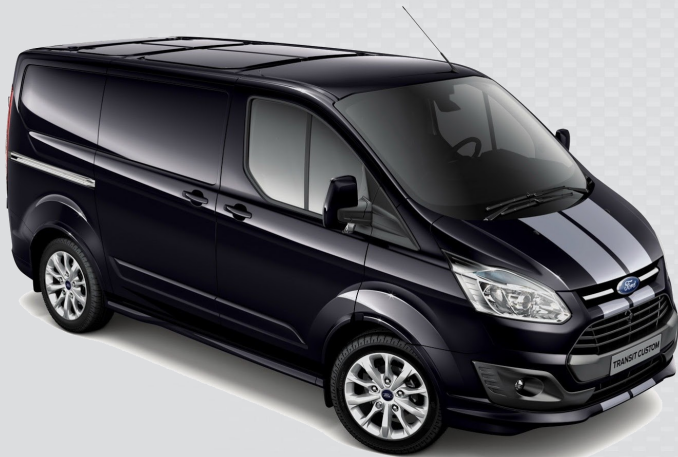
Spring Characteristic HV-067074