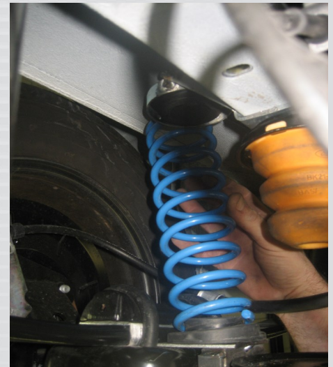
Spring Characteristic HV-068160