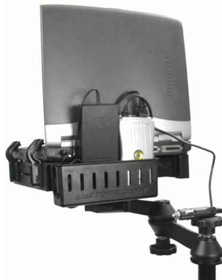
RAM-234-3 UNIVERSAL LAPTOP TRAY SHOWN WITH COMPUTER AND OPTIONAL #RAM-234-5 POWER CADDY FOR HOLDING VARIOUS AFTERMARKET POWER SUPPLIES

RAM is the revolutionary universal mounting system that allows you to mount practically anything anywhere. Whether its in a boat, aircraft, automobile, ATV, motorcycle or any other situation, RAM's family of over 800 interchangeable accessories will offer you solutions to your most challenging mounting problems. If you need to mount a radar, sonar, GPS, computer, cellular phone, antenna, or just about anything else look no further. RAM mounts will help you make a professional job easy and affordable. They will allow you to reposition or remove your electronics for perfect viewing or safe keeping. It's unique design provides easy installation, mobility, strength, versatility, vibration protection and durability, all at a low cost. RAM is backed by NPI's renowned Lifetime Warranty which makes it the mounting system of choice. To provide light weight strength and corrosion resistance, RAM is made of marine grade aluminum with a powder coated finish, stainless steel hardware and rubber balls. Visit the RAM web site at: www.ram-mount.com to see the newest products and to learn more about this revolutionary mounting system.